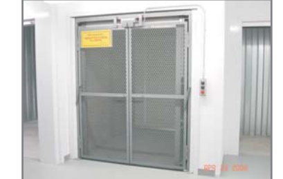
Customer shaft, our expanded metal gates Bi-parting double swing electro-mechaincally interlocked

Double Frame Vertical Reciprocating Conveyors are specifically designed for vertical movement of a large, bulky, heavy material from one elevation to another. Requires minimal floor space and easily installed. The model RJS-2 can be surface mounted or placed in a shallow pit. Our RJS-2 model comes with all the same safety features as the RJS model. The RJS-2 has 2 pistons each with dual ANSI chains.