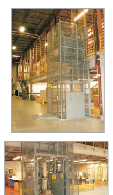
Mezzanine Application full height enclosure includes electro-mechanically interlocked gates

Vertical Reciprocating Conveyors require minimal usage of floor space and provide access to various levels....mezzanines, upper floors, basements, multi-level stories, lofts, split level entrances and production lines now can be utilized for increase production and storage. Safely transport any type of material or product from one level to another with full call and send system.