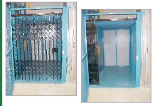
Freight style folding gates

All our cabs can incorporate electrically interlocked gates and doors exceeding the Requirement of ANSI/ASME B20.1